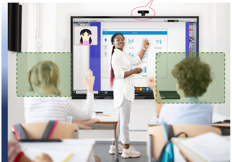
*Intuitively shows the person speaking and follows the conversation, switching focus as the speaker changes.